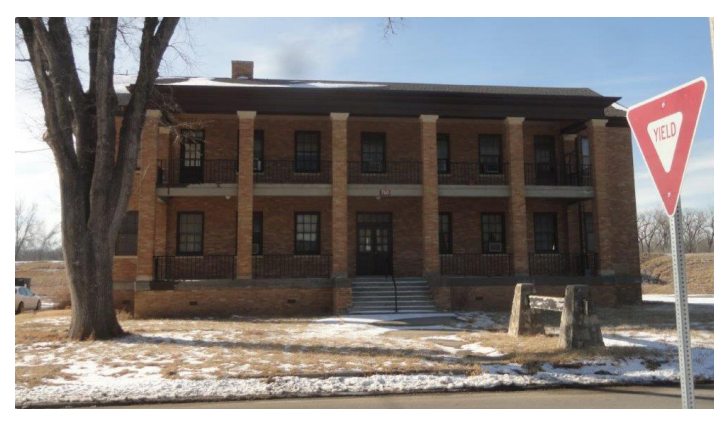
Fort Riley Renovation Project

Scope of Work: All historic features will be preserved and restored to original designs. This includes upgrades to glazed windows to meet antiterrorism standards. Exterior masonry will be repaired and restored. A new asphalt parking lot will be constructed... Interior upgrades include adding modern amenities in restrooms, upgrades of toilet facilities and new flooring throughout.