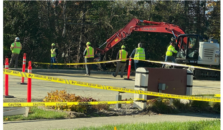
LGC equipment at work

LGC crews repaired the broken 48” underground pipe. It was not in the same location as the water main break in 2017 when LGC replaced an aging pipe. Water flooded several streets and caused low water pressure in some homes. A boiled water advisory was issued. According to Cheryl Porter, Chief Operating Office for GLWA, a full analysis will be done to determine the cause and if further assessments are needed.