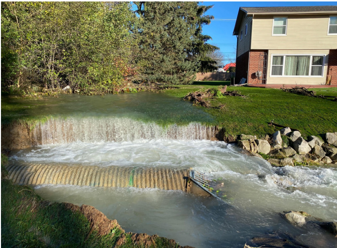
Water flow of broken main

Homeowners near the intersection of 14 Mile Road and Drake were greatly impacted by a water main break that occurred on Sunday, October 31st. Several communities were affected including Novi, Commerce Township and Walled Lake.