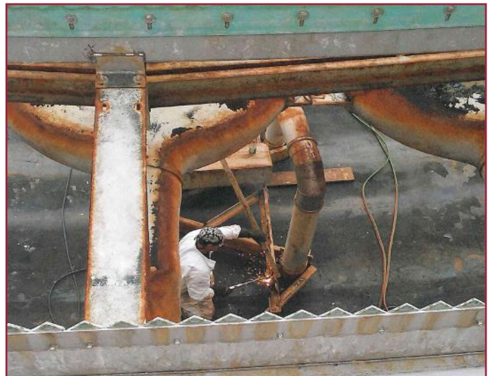
Repairs being made on Tank B-25 at W. Jefferson Avenue Wastewater Treatment Plant

The project consists of constructing a new 30" diameter water main parallel and about 40 feet east of the W. Jefferson Bascule Bridge below the Rouge River. The new water main will carry fresh water from the City of River Rouge towards the east into the GLWA treatment plant facility.