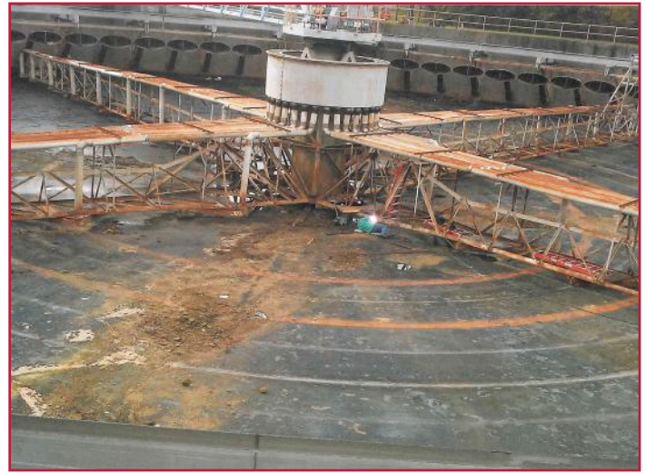
Primary Clarifier Tank 25 at the Detroit W. Jefferson Avenue Wastewater Treatment Plant.

This project consists of providing labor to complete major and minor skilled trade maintenance projects including rebuilding or replacing of process or pumping equipment and making building improvements at the Wastewater Treatment Plant Facility on W. Jefferson Avenue in Detroit.