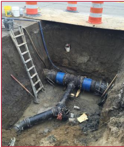
Replacement of Water Main Piping

This project consists of the replacement of existing 8", 12" and 16" water main piping along Davison Avenue from Livernois to Linwood and Joy Road from Greenfield to Schaefer.